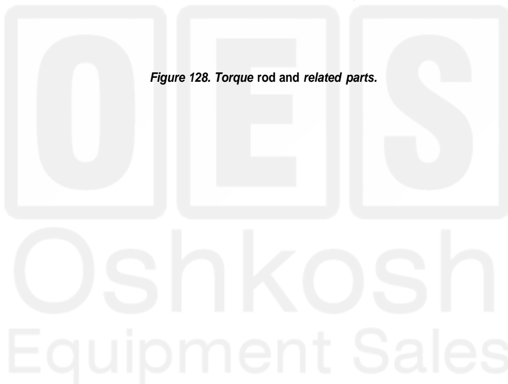
Figure 128. Torque rod and related parts.

Current part is item (140) on diagram. Available at www.oshkoshequipment.com